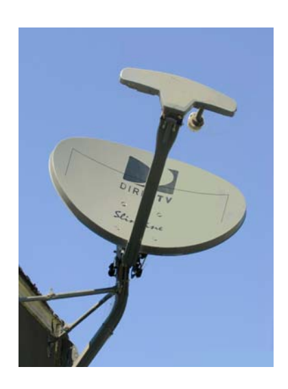
Figure 2: My modified TV satellite dish. Note low visibility of the uncovered slot.