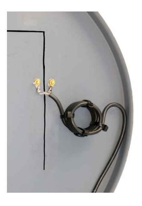
Figure 6: Coax attachment, 4½ in. from end. Note six turn coiled-coax 1:1 choke balun.

of RG-58 coax, secured with UV-stabilized ty-wraps. I used clear silicon adhesive to attach the balun to the back of the dish.