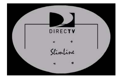
Figure 1: Representation of a horizontal slot antenna cut into the reflector of a SlimLine DIRECTV satellite dish.

A slot antenna is a narrow rectangular opening in a large conductive surface, such as a TV satellite dish. Slot antennas are familiar in the commercial radio world, but not to hams. They're common in TV broadcasting, the skin of aircraft and in radar, microwave and cell phone applications. This disguised TV dish slot is equal to a J-pole (Figures 1 and 2) and is also a great way to learn about slot antennas.