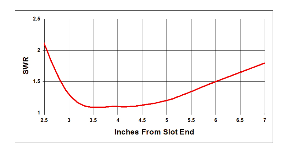
Figure 5: Feed point SWR near the end of the slot. 4.5 in. is a good compromise for most dish locations

Then, because all antennas are affected by location, during my learning curve, I used an easy-to-move feed-line-attachment fixture. With it I found that feed point location is not touchy. See Figure 5. You needn't duplicate my movable fixture. It will be fine to directly make a permanent attachment. See Figure 6.